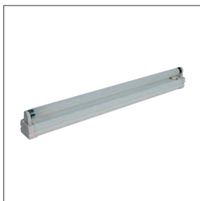
Corp fluorescent tip SS30 cu un tub D-170 - A Cod 019.010.190.001