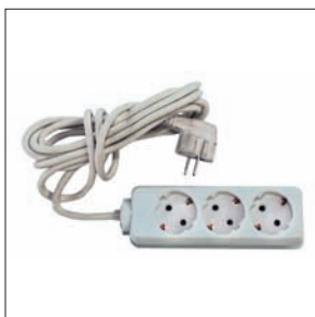
Prelungitor 230V, 10A, 3m Cod 019.010.277.000