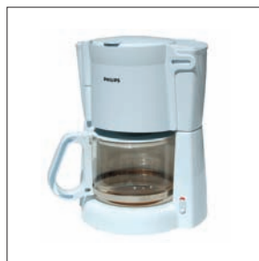
Filtru de cafea Cod 025.010.120.010