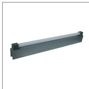
Corp fluorescent tip SS30 cu un tub D-170 Cod 019.010.190.000