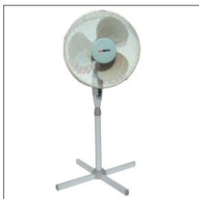
Ventilator cu picior Cod 025.010.500.020