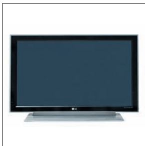
TV Plasma (diagonala ecran: 107 cm) Cod 025 010 130 040