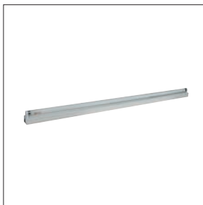
Lampa fluorescenta FIA cu instalatie electrica completa 1x40W Cod 019.010.110.000