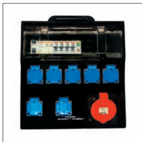
Panou Electric 380V/220V Cod 019.010.265.000