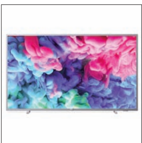
TV LED SMART 4K, UHD ultrasubtire (diagonala ecran: 126 cm) Cod 025 010 130 045