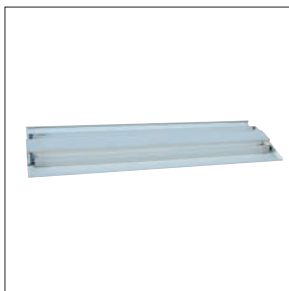
Corp fluorescent tip OCTANORM cu doua tuburi D-171 Cod 019.010.200.000