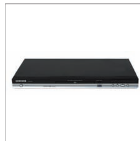
DVD Player Cod 025 010 130 030