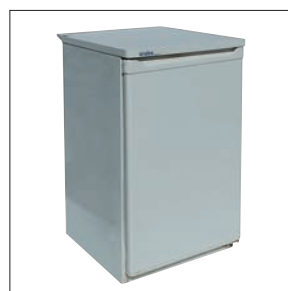
Frigider ARCTIC (180 l) Cod 025 010 070 020