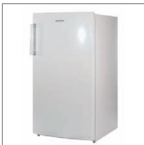
Frigider ARCTIC FB 155 Cod 025 010 020 198