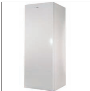
Frigider ARCTIC 255 l Cod 025 010 020 199