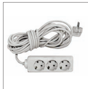
Prelungitor 230V, 10A, 5m Cod 019.010.279.000