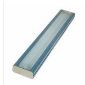
Corp fluorescent tip SYMA STAR Cod 019.010.200.001