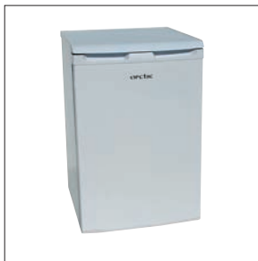
Racitor (140 l) Cod 025 010 070 010 (55 x 61 x 84 cm)