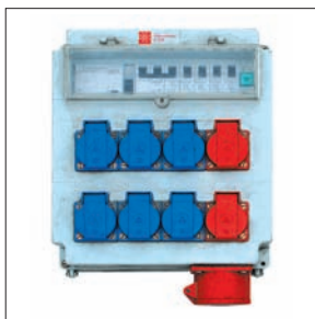
Panou Electric OCTANORM Cod 019.010.275.000