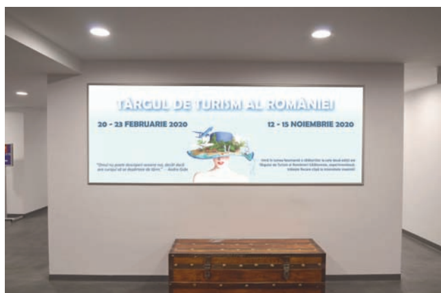
SNAP FRAME, SIZE 320X110 CM