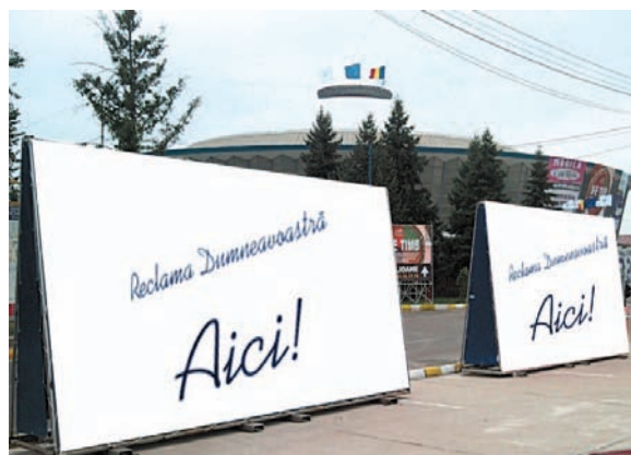
BANNER DISPLAY ON MOBILE PLATFORMS