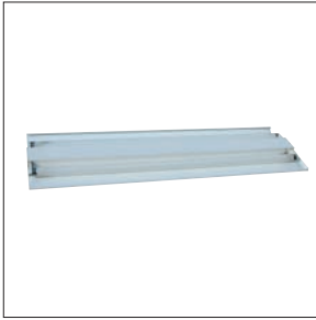
Fluorescent lighting OCTANORM type with double-tube D-171 Code 019.010.200.000 EUR 23.00