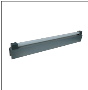
Fluorescent lighting SS30 type with D-170 tube Code 019.010.190.000 EUR 18.00