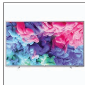
TV LED SMART 4K, UHD ultrathin (diagonal screen: 126 cm) Code 025 010 130 045 EUR 45.00/day