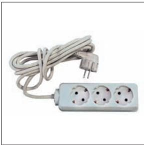
Extension cable 230V, 10A, 3m Code 019.010.277.000 EUR 12.00