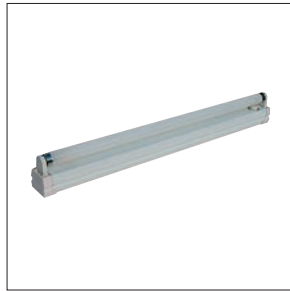
Fluorescent lighting SS30 type with D-170-A tube Code 019.010.190.001 EUR 21.00