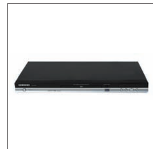
DVD Player Code 025 010 130 030 EUR 45.00