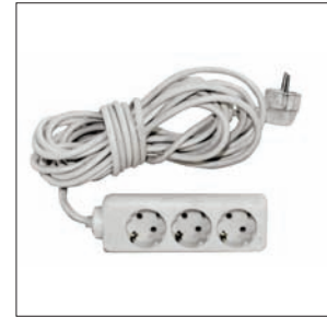
Extension cable 230V, 10A, 5m Code 019.010.279.000 EUR 12.00