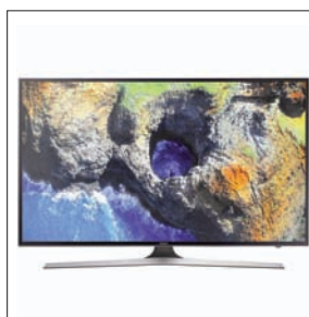
TV SAMSUNG UHD (diagonal screen: 163 cm) Code 025 010 130 047 EUR 65.00/day