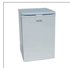
Cooler (140 l) Code 025.010.070.015 (55 x 61 x 84 cm) EUR 28.00