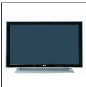
Plasma TV (diagonal screen: 107 cm) Code 025 010 130 040 EUR 28.00/day