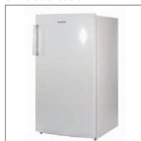
Refrigerator ARCTIC FB 155 Code 025 010 020 198 EUR 28.00