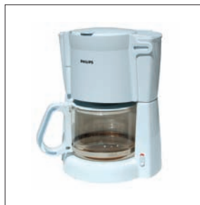
Coffee maker Code 025.010.120.010 EUR 6.00