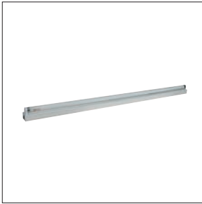
Fluorescent lamp FIA with complete electric installation 1x40W Code 019.010.110.000 EUR 18.00