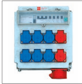
Electrical panel OCTANORM Code 019.010.275.000 EUR 130.00