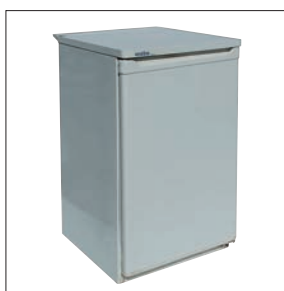
Refrigerator ARCTIC (180 l) Code 025 010 070 020 EUR 49.00