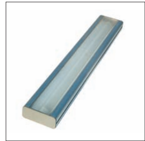
Fluorescent lighting SYMA STAR type Code 019.010.200.001 EUR 21.00