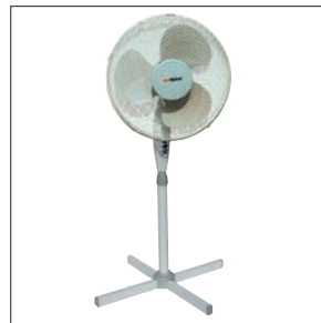
Standing fan Code 025.010.500.020 EUR 9.00