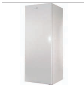
Refrigerator ARCTIC 255 l Code 025 010 020 199 EUR 60.00