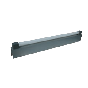
Corp fluorescent tip SS30 cu un tub D-170 Cod 019.010.190.000