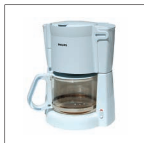
Filtru de cafea Cod 025.010.120.010