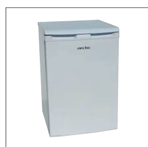
Racitor (140 l) Cod 025 010 070 010 (55 x 61 x 84 cm)