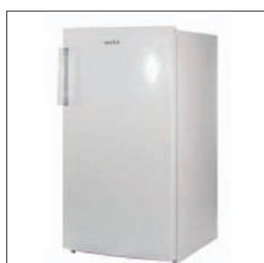
Frigider ARCTIC FB 155 Cod 025 010 020 198