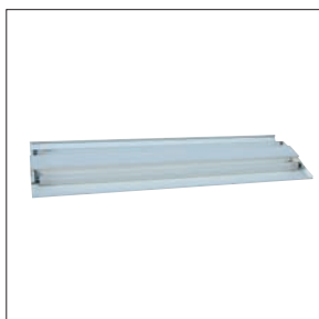
Corp fluorescent tip OCTANORM cu doua tuburi D-171 Cod 019.010.200.000