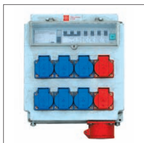
Panou Electric OCTANORM Cod 019.010.275.000