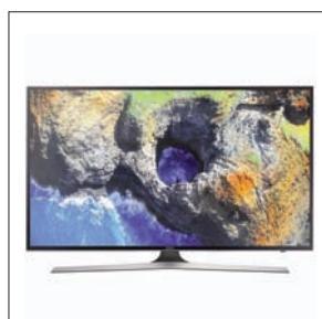
TV SAMSUNG UHD, (diagonala ecran: 163 cm) Cod 025 010 130 047