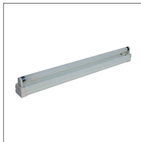
Corp fluorescent tip SS30 cu un tub D-170 - A Cod 019.010.190.001