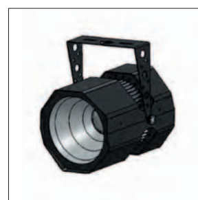
Reflector LED VIRGO EUR 40.00 40W 4350 LM 4100 K Cod 019.010.200.045