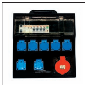
Panou Electric 380V/220V Cod 019.010.265.000