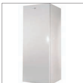
Frigider ARCTIC 255 l Cod 025 010 020 199