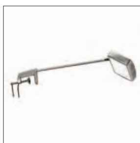
Reflector tija LED A++ EUR 35.00 16W 1100LM 4000K ARM33CM Cod 019.010.200.040