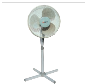
Ventilator cu picior Cod 025.010.500.020