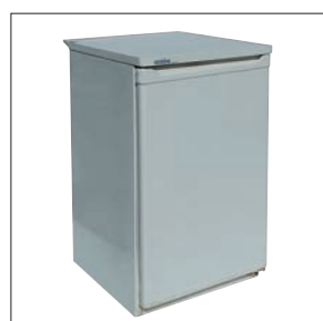
Frigider ARCTIC (180 l) Cod 025 010 070 020