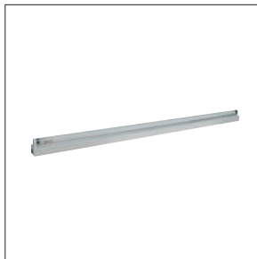
Lampa fluorescenta FIA cu instalatie electrica completa 1x40W Cod 019.010.110.000