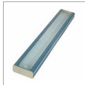
Corp fluorescent tip SYMA STAR Cod 019.010.200.001