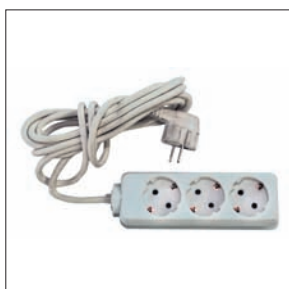
Prelungitor 230V, 10A, 3m Cod 019.010.277.000