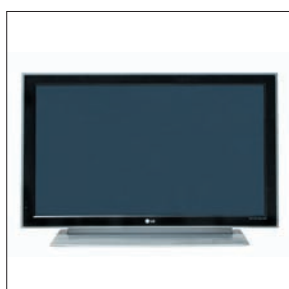
TV Plasma (diagonala ecran: 107 cm) Cod 025 010 130 040