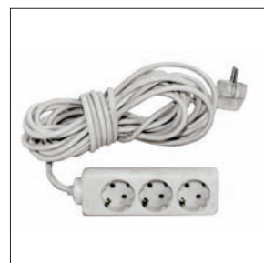
Prelungitor 230V, 10A, 5m Cod 019.010.279.000