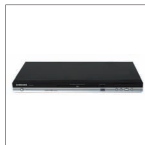
DVD Player Cod 025 010 130 030