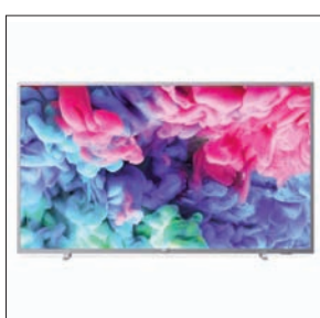
TV LED SMART 4K, UHD ultrasubtire (diagonala ecran: 126 cm) Cod 025 010 130 045